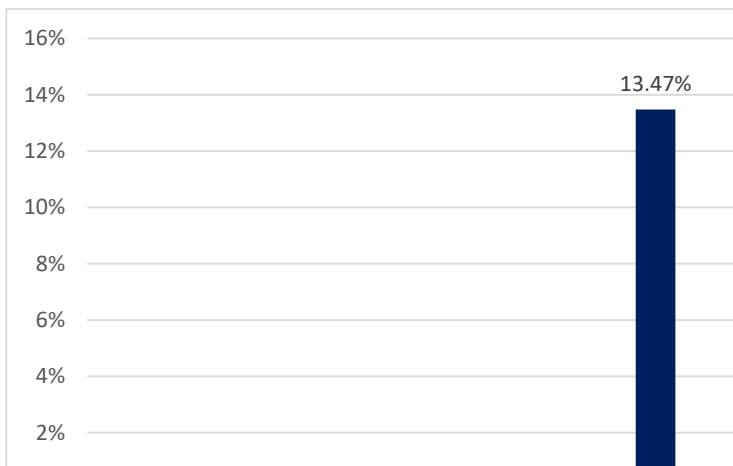
Annual Performances of Varenne Global A-EUR